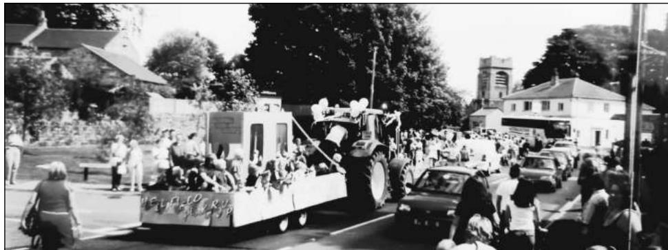
Gala parade down the Main Road.

event was held the night before the gala, either in the Black Horse or Hellifield House - and eventually in a large marquee on the Gala field. Hugely popular, the local performers were not shy in coming forward to entertain the village. With processions