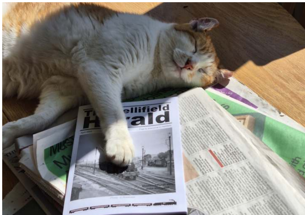
Someone who is obviously a fan of the village magazine - Ed

Despite choosing Park Avenue as a safe street for cats, we lost Nougat on the main road; leaving GW to become No.1 cat. And, I am pleased to say that the 'kill rate' became zero!