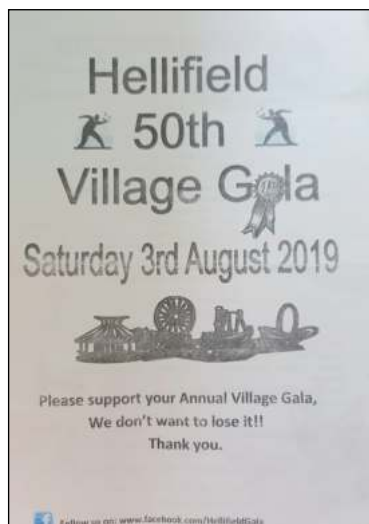
The final Gala event, 2019

round the village, fancy dress, stalls, brass bands etc, the Gala continued to be a significant event during August of every year, until in 2019 after its 50th Gala the committee finally called it a day due to a shortage of willing volunteers to keep the event going.