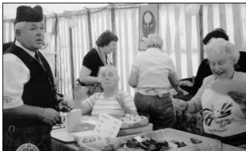
Feeding the masses in the Gala tent.