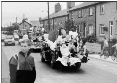
Procession up Midland Terrace.