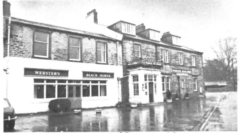
The Black Horse Hotel