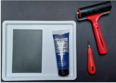
To the left: basic equipment - ink, ink pad, lino cutter and roller.